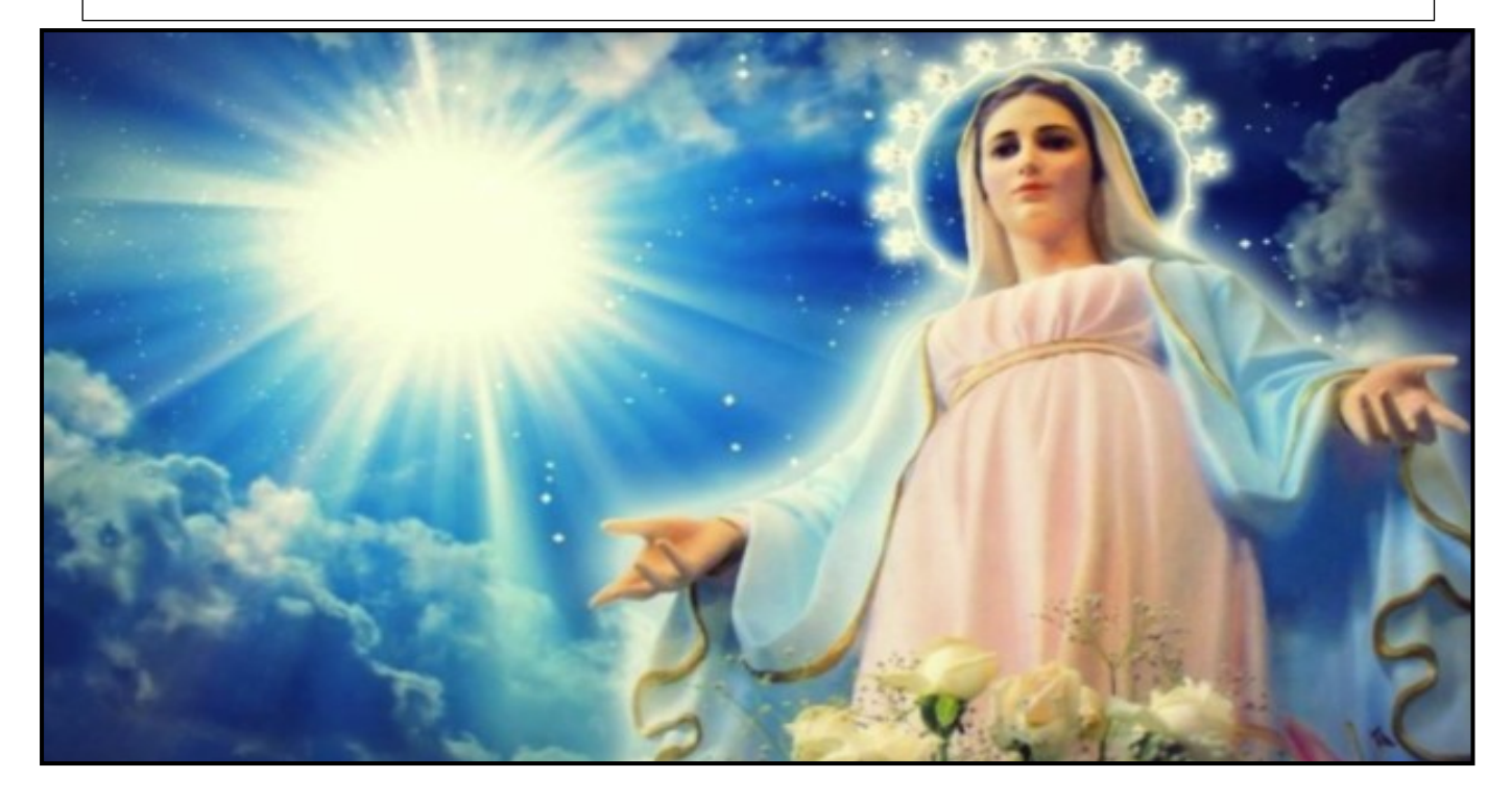
FIFTH SUNDAY OF THE RESURRECTION MAY 18, 2025